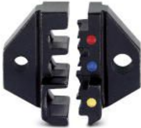
Spare die for CRIMPFOX-RCI 6-1

Please be informed that the data shown in this PDF Document is generated from our Online Catalog. Please find the complete data in the user's documentation. Our General Terms of Use for Downloads are valid ( http://phoenixcontact.com/download )