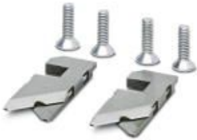
Spare knife for stripping machine

Please be informed that the data shown in this PDF Document is generated from our Online Catalog. Please find the complete data in the user's documentation. Our General Terms of Use for Downloads are valid ( http://phoenixcontact.com/download )