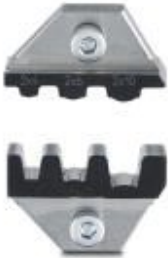
Die for crimping machine CF 500, for TWIN ferrules (AI-TWIN...) 2 x 4, 2 x 6 and 2 x 10 mm 2

Please be informed that the data shown in this PDF Document is generated from our Online Catalog. Please find the complete data in the user's documentation. Our General Terms of Use for Downloads are valid ( http://phoenixcontact.com/download )