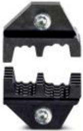
Die for crimping machine CF 500, for ferrules (A... and AI...) 35 and 50 mm 2

Please be informed that the data shown in this PDF Document is generated from our Online Catalog. Please find the complete data in the user's documentation. Our General Terms of Use for Downloads are valid ( http://phoenixcontact.com/download )