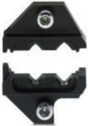
Die for crimping machine CF 500, for turned contacts with 4.0 mm pin diameter (CK 4.0) 6 ... 10 mm 2

Please be informed that the data shown in this PDF Document is generated from our Online Catalog. Please find the complete data in the user's documentation. Our General Terms of Use for Downloads are valid ( http://phoenixcontact.com/download )