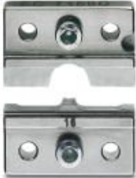
Die for crimping machine CF 500, for uninsulated cable lugs (C-RC... and C-FC...) 16 mm 2

Please be informed that the data shown in this PDF Document is generated from our Online Catalog. Please find the complete data in the user's documentation. Our General Terms of Use for Downloads are valid ( http://phoenixcontact.com/download )