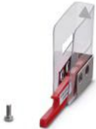
Protective cover for crimping machine CF 500, for ferrules 0.25 - 6 mm 2 (AI 6...)

Please be informed that the data shown in this PDF Document is generated from our Online Catalog. Please find the complete data in the user's documentation. Our General Terms of Use for Downloads are valid ( http://phoenixcontact.com/download )