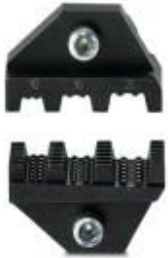
Die for crimping machine CF 500, for ferrules (A... and AI...) 10.16 and 25 mm 2

Please be informed that the data shown in this PDF Document is generated from our Online Catalog. Please find the complete data in the user's documentation. Our General Terms of Use for Downloads are valid ( http://phoenixcontact.com/download )