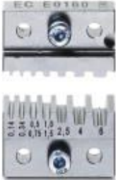
Die for CF 500 crimping machine, for ferrules (A... and AI...) 0.08 ... 6 mm 2

Please be informed that the data shown in this PDF Document is generated from our Online Catalog. Please find the complete data in the user's documentation. Our General Terms of Use for Downloads are valid ( http://phoenixcontact.com/download )