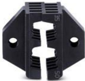
Spare die, for CRIMPFOX 50R

Please be informed that the data shown in this PDF Document is generated from our Online Catalog. Please find the complete data in the user's documentation. Our General Terms of Use for Downloads are valid ( http://phoenixcontact.com/download )