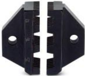
Spare die for CRIMPFOX 25R

Please be informed that the data shown in this PDF Document is generated from our Online Catalog. Please find the complete data in the user's documentation. Our General Terms of Use for Downloads are valid ( http://phoenixcontact.com/download )