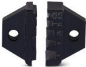
Spare die for CRIMPFOX 6

Please be informed that the data shown in this PDF Document is generated from our Online Catalog. Please find the complete data in the user's documentation. Our General Terms of Use for Downloads are valid ( http://phoenixcontact.com/download )