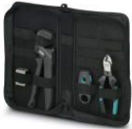
Tool set, equipped

Please be informed that the data shown in this PDF Document is generated from our Online Catalog. Please find the complete data in the user's documentation. Our General Terms of Use for Downloads are valid ( http://phoenixcontact.com/download )