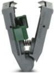
Spare knife, for QUICK WIREFOX 18

Please be informed that the data shown in this PDF Document is generated from our Online Catalog. Please find the complete data in the user's documentation. Our General Terms of Use for Downloads are valid ( http://phoenixcontact.com/download )