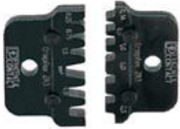
Crimp insert, for ferrules, 0.25 - 6.0 mm 2

Please be informed that the data shown in this PDF Document is generated from our Online Catalog. Please find the complete data in the user's documentation. Our General Terms of Use for Downloads are valid ( http://phoenixcontact.com/download )