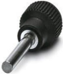
Replacement fixing bolts, for the crimping device CF 3000-2,5

Please be informed that the data shown in this PDF Document is generated from our Online Catalog. Please find the complete data in the user's documentation. Our General Terms of Use for Downloads are valid ( http://phoenixcontact.com/download )