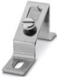
Angled brackets with M6 screw, DIN rail limit stop, for fixing DIN rails at an angle of 30°, with M6 screw, height: 35.4 mm

Please be informed that the data shown in this PDF Document is generated from our Online Catalog. Please find the complete data in the user's documentation. Our General Terms of Use for Downloads are valid ( http://phoenixcontact.com/download )