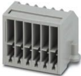
PCB header, 6-pos.

Please be informed that the data shown in this PDF Document is generated from our Online Catalog. Please find the complete data in the user's documentation. Our General Terms of Use for Downloads are valid ( http://phoenixcontact.com/download )